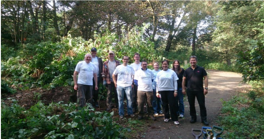
Lloyds Banking Group volunteers 12/09/

Attention is now turning to Salmonberry removal over the winter. This is only done out with the nesting season. An enthusiastic group from Lloyds Banking volunteered recently and cleared some large areas. The arisings will be burnt onsite once dried out. Students from the Royal High School will be volunteering their time over the winter period as part of their John Muir Award specifically dealing with Salmonberry.