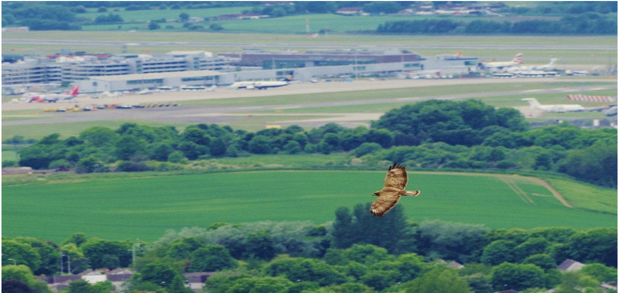
A buzzard from Corstorphine Hill Tower